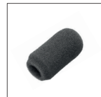
3M™ PELTOR™ Wind shield M171/2